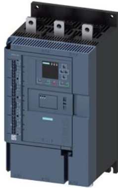
SIRIUS soft starter 200-690 V 210 A, 110-250 V AC spring-type terminals