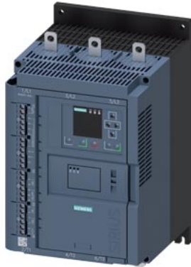
SIRIUS soft starter 200-480 V 171 A, 110-250 V AC Screw terminals