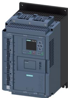
SIRIUS soft starter 200-690 V 63 A, 110-250 V AC spring-type terminals