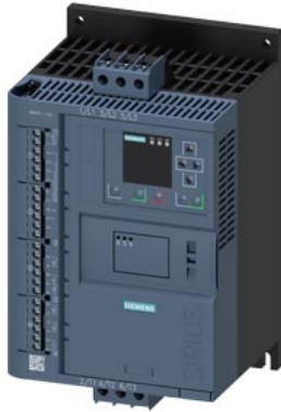
SIRIUS soft starter 200-600 V 25 A, 110-250 V AC Screw terminals