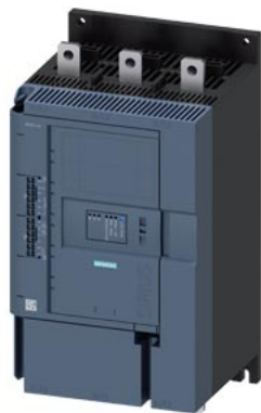
SIRIUS soft starter 200-480 V 570 A, 24 V AC/DC spring-type terminals Analog output