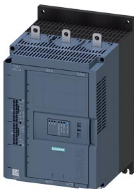
SIRIUS soft starter 200-600 V 171 A, 24 V AC/DC spring-type terminals Analog output