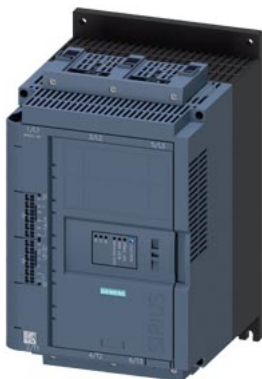
SIRIUS soft starter 200-600 V 47 A, 24 V AC/DC spring-type terminals Analog output