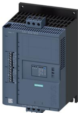
SIRIUS soft starter 200-600 V 38 A, 110-250 V AC Screw terminals Thermistor input