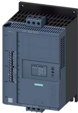
SIRIUS soft starter 200-600 V 32 A, 110-250 V AC Screw terminals Thermistor input