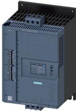
SIRIUS soft starter 200-480 V 25 A, 24 V AC/DC Screw terminals Thermistor input