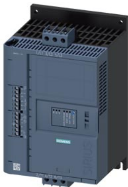
SIRIUS soft starter 200-480 V 13 A, 110-250 V AC Screw terminals Analog output