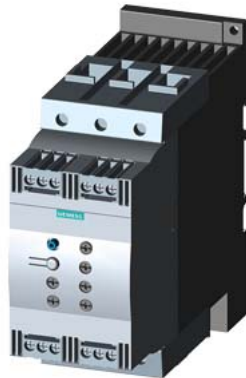
SIRIUS soft starter S3 106 A, 55 kW/400 V, 40 °C 200-480 V AC, 110-230 V AC/DC Screw terminals