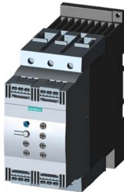
SIRIUS soft starter S3 80 A, 45 kW/400 V, 40 °C 200-480 V AC, 24 V AC/DC spring-type terminals