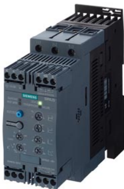
SIRIUS soft starter S2 45 A, 30 kW/500 V, 40 °C 400-600 V AC, 24 V AC/DC Screw terminals