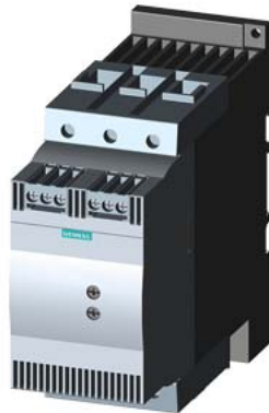
SIRIUS soft starter S3 106 A, 55 kW/400 V, 40 °C 200-480 V AC, 110-230 V AC/DC Screw terminals