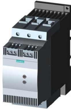
SIRIUS soft starter S3 80 A, 45 kW/400 V, 40 °C 200-480 V AC, 110-230 V AC/DC Screw terminals