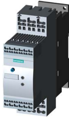
SIRIUS soft starter S0 25 A, 11 kW/400 V, 40 °C 200-480 V AC, 110-230 V AC/DC spring-type terminals