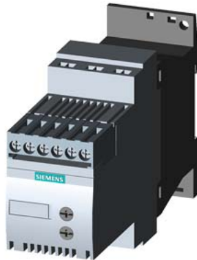
SIRIUS soft starter S00 9 A, 4 kW/400 V, 40 °C 200-480 V AC, 24 V AC/DC Screw terminals