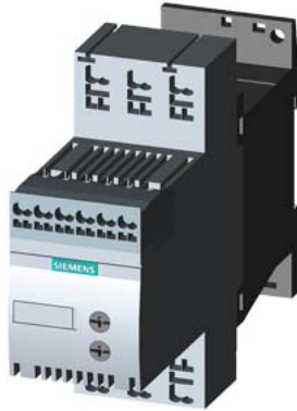
SIRIUS soft starter S00 3.6 A, 1.5 kW/400 V, 40 °C 200-480 V AC, 24 V AC/DC Spring-type terminals