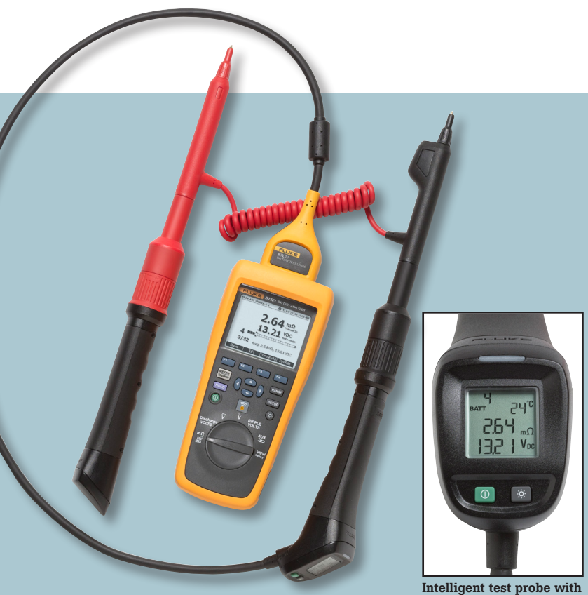
Intelligent test probe wit integrated LCD display