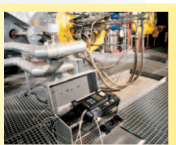
Fully functional while inside case